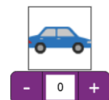
Add or delete objects from the Pictogram