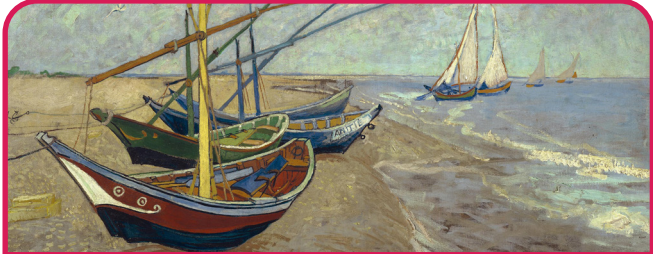
Vincent Van Gogh One of the most famous post-impressionist painters. He was from the Netherlands.