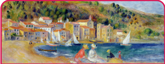
Auguste Renoir An artist from France who was a leading painter in the development of the Impressionist style.