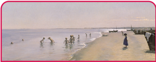
Peder Severin Kroyer A painter from Denmark.