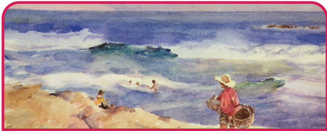
Joaquin Sorolla A painter from Spain, who painted portraits and landscapes.