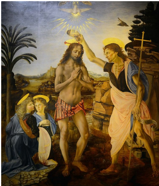
The Baptism of Christ By Verrocchio

The Holy Spirit is represented in the Christian Church through different symbols.